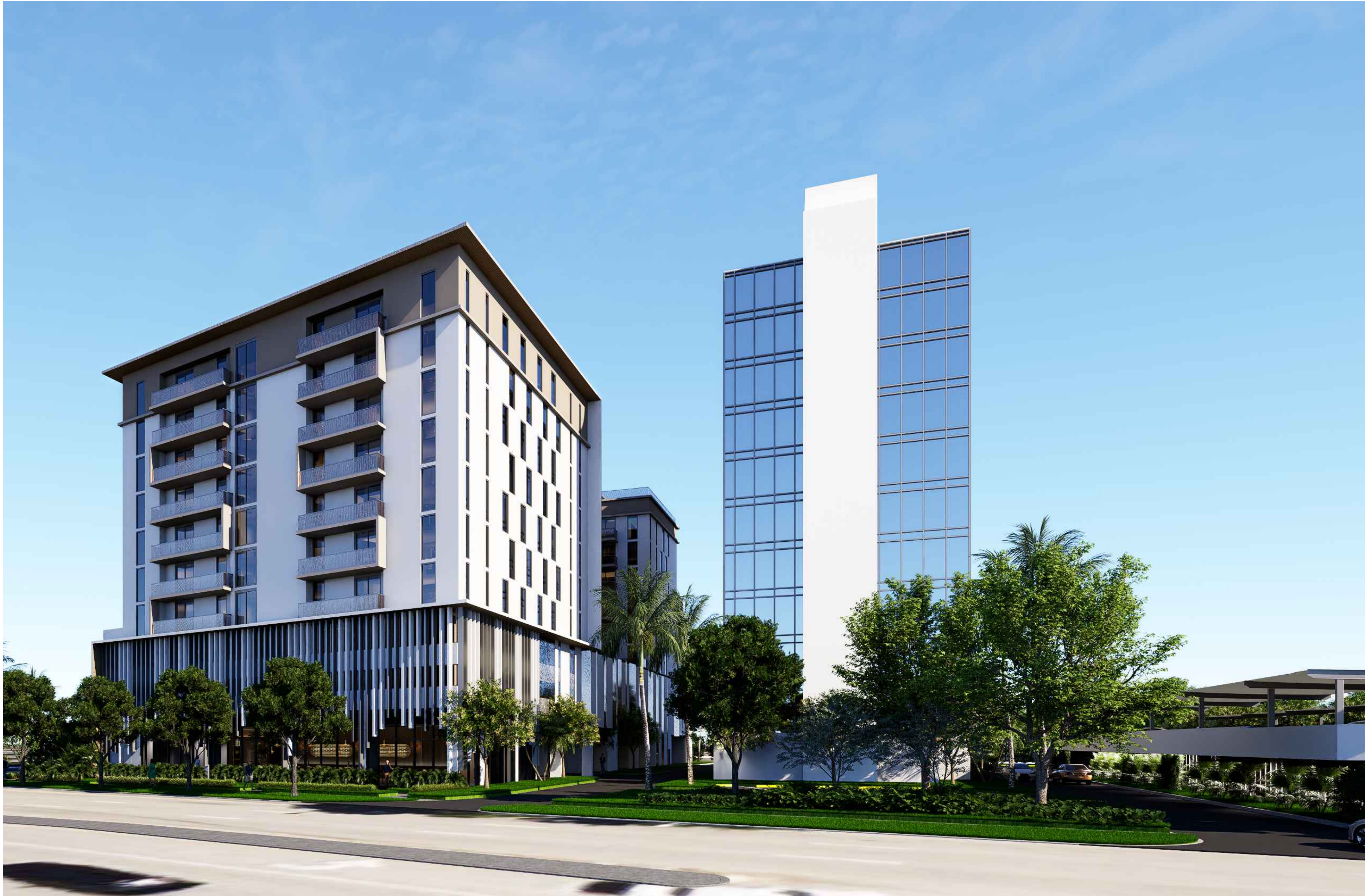
STREET VIEW OF THE SOUTH WEST CORNER OF THE BUILDING